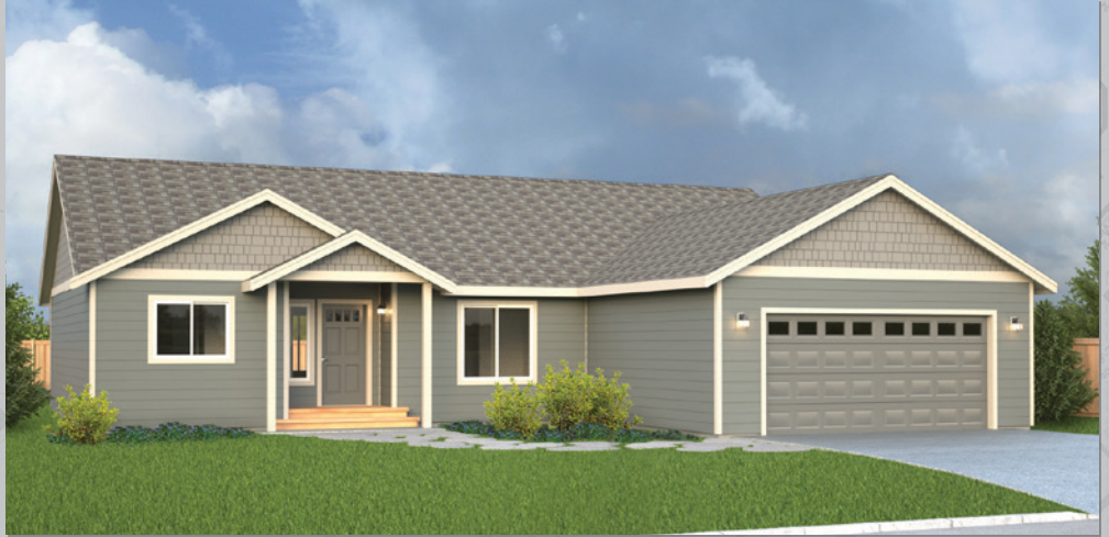
Artist rendering and/or plan may show optional features not included in base price.

Plan Type: Single Story Plan Name: Jackson Ridge Footprint: 56' x 52' Living Area: 1720 sqft Garage Type: 2 Car Bedrooms: 3 Bed Baths: 2 Bath