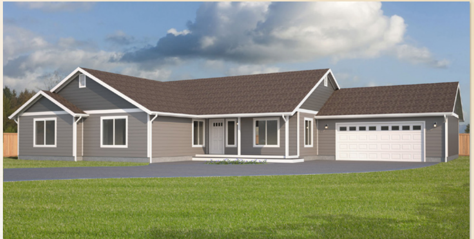
Artist rendering and/ or plan may show optional features not included in base price.

Plan Type: Single Story Plan Name: Greythorne Footprint: 76' x 54' Living Area: 2370 sq ft Garage Type: 2 Car Bedrooms: 4 Bed Baths: 2.5 Bath